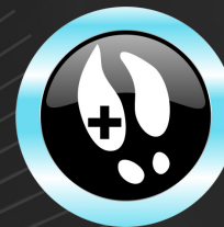
Herd Health Software

Cervid Solutions has engineered our cutting-edge Life Cycles Program with you, the member, in mind. The program we provide is in-depth, professionally developed and available as part of our Cervid Membership Program. It consists of three primary technologies.